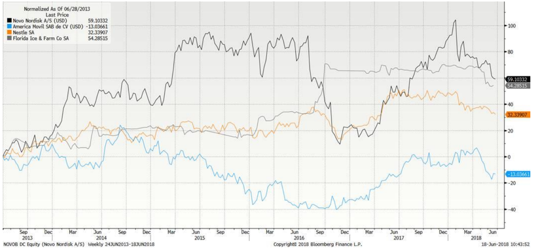
Five year price chart in USD of Novo Nordisk, America Movil SAB, Nestle and Florida Ice & Farm