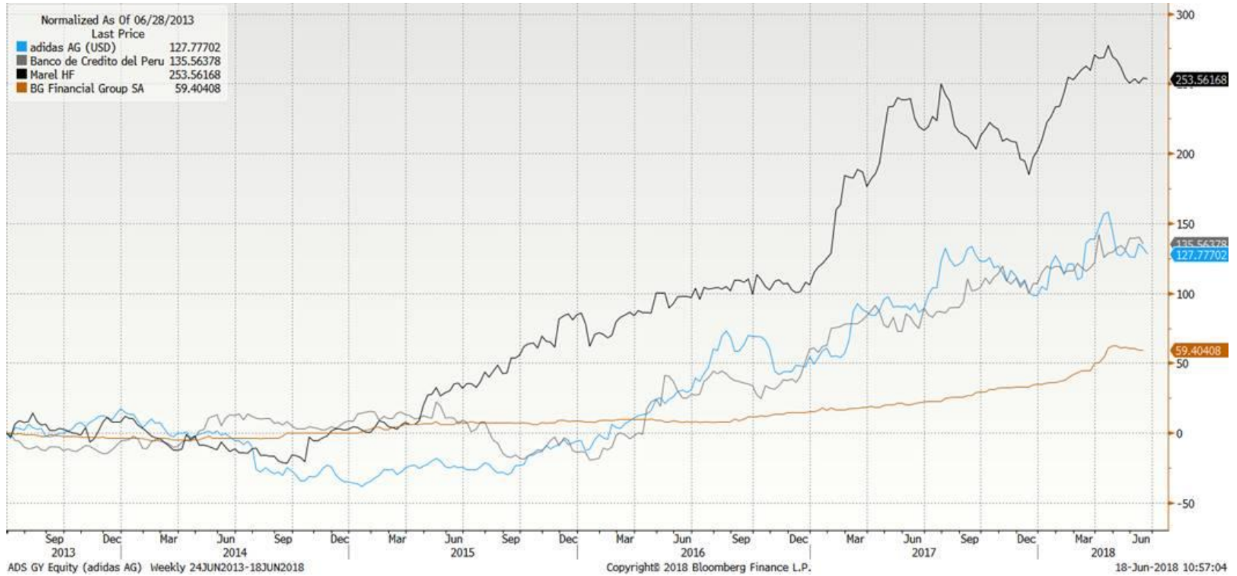
Five year price chart in USD of Adidas, Banco de Credito del Peru, Marel HF and BG Financial Group