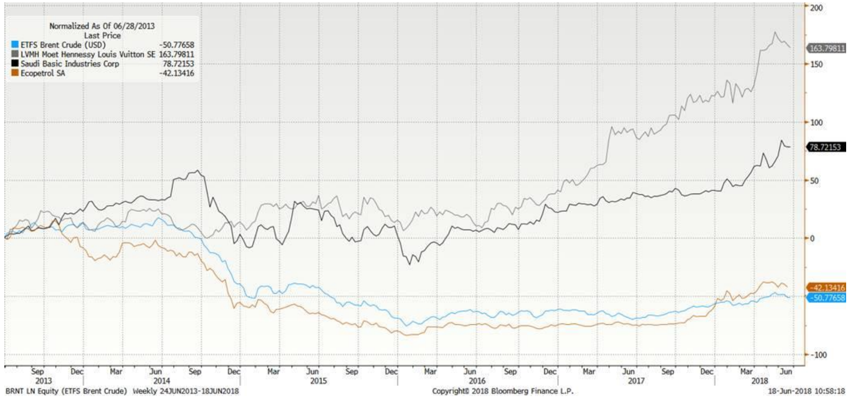
Five year price chart in USD of Brent Crude, LVMH, Saudi Basic Industries and Ecopetrol