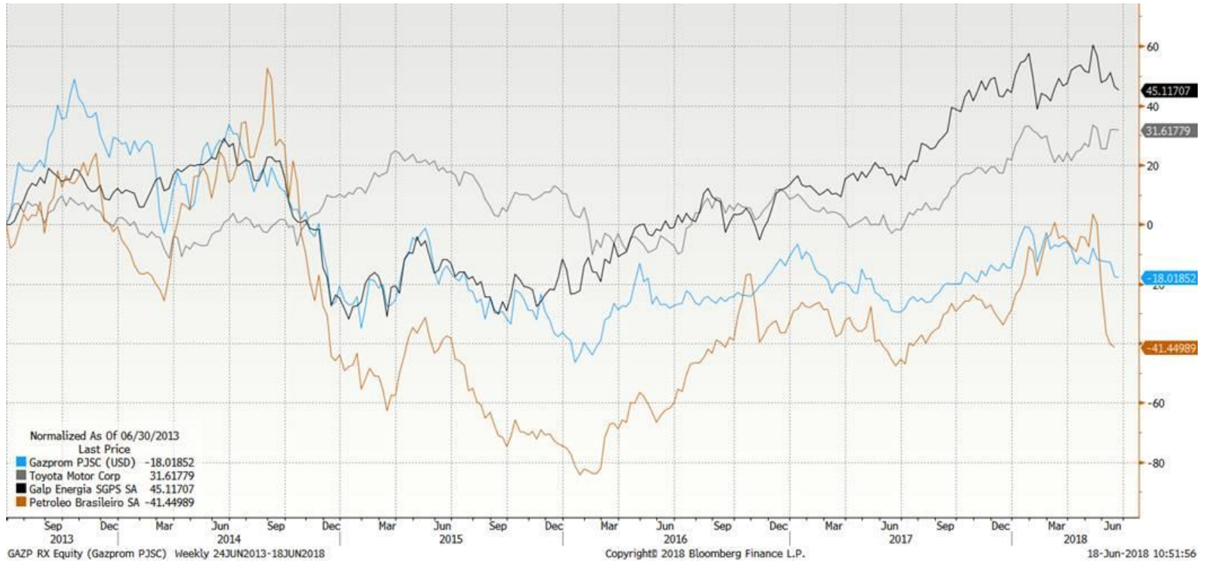
Five year price chart in USD of Gazprom, Toyota Motor, Galp Energia and Petroleo Brasileiro