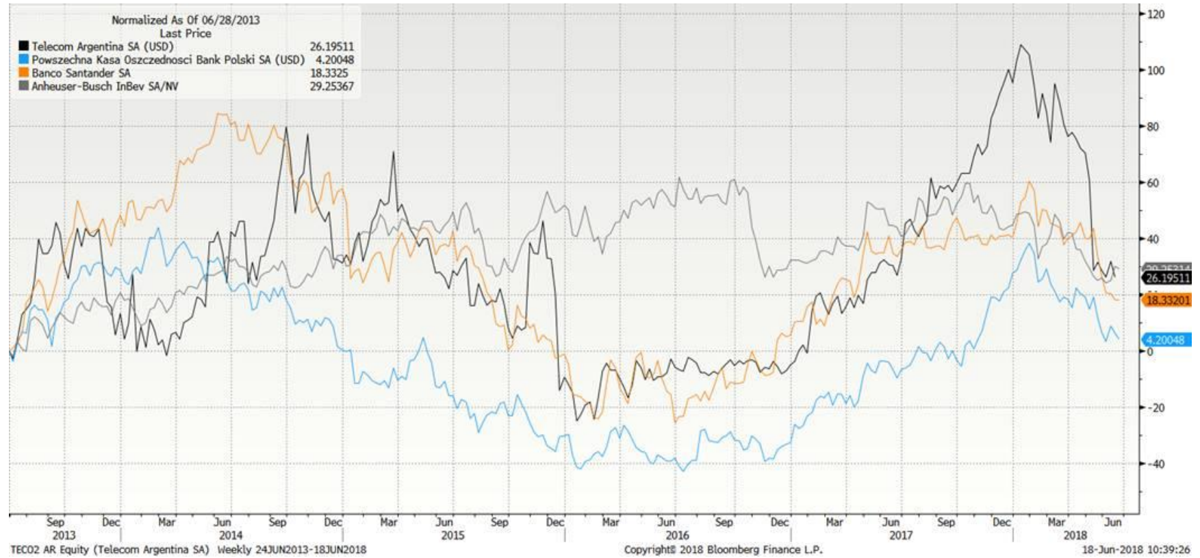
Five year price chart in USD of Telecom Argentina, PKOBP, Banco Santander and Anheuser-Busch InBev