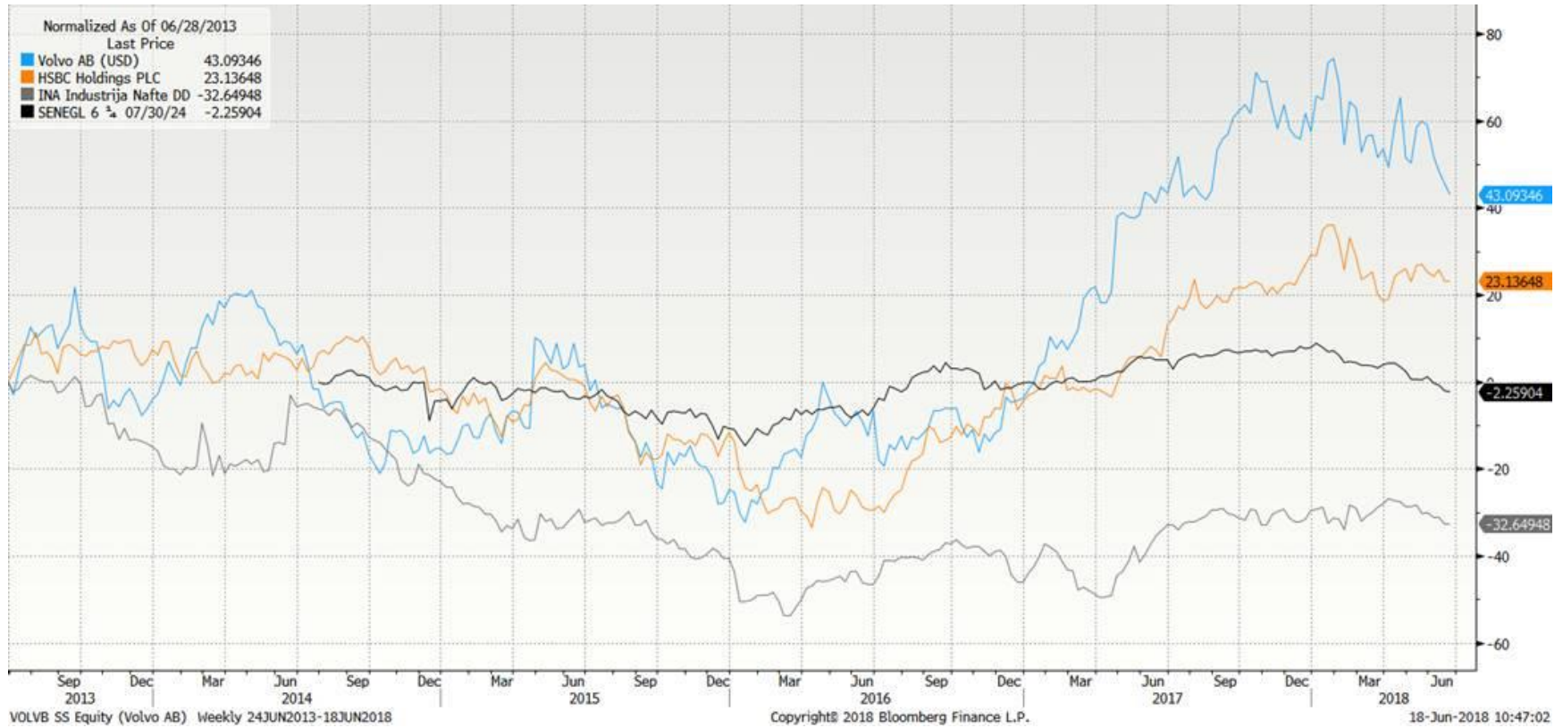
Five year price chart in USD of Volvo, HSBC, INA Industrija and Senegal 6.25% 2024